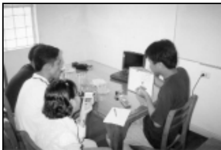
Philippines infoDev Information Officer training staff of Pinoy-Plus, a Manila-based NGO.

In all three countries, one of the project's objectives was to establish a culture of information exchange. E-mail lists focusing on HIV/AIDS or wider issues were established. In each country, however, use of e-mail lists differed. In