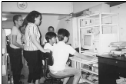
Staff at the Manila-based NGO, The Children's Lab, e-mailing counterparts in Indonesia.

Sustainability: Although the project was only recently completed in a number of countries, a pattern has emerged with regard to ensuring that ongoing electronic access is sustainable. Those organizations, specifically in the Philippines, that incorporated e-mail and/or Internet technology into their daily work processes during the project's term, ensured sustainability regarding continuous funding expansion and strengthening of their e-mail and networking capabilities. The organizations in the Philippines and, increasingly, in Thailand are two examples of sustainability.